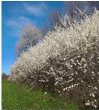
Prunus Spinosa 1+1 (Blackthorn) - 10%