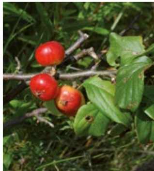
Malus Sylvestris 1+1 (Crab apple) - 5%

Some species may be changed according to availability and to suit particular soil conditions, but the percentages should remain the same.