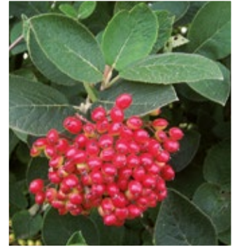
Viburnum Lantana 1+1 (Wayfaring tree) - 5%