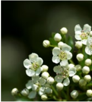
Crataegus Monogyna 1+1 (Hawthorn) - 60%