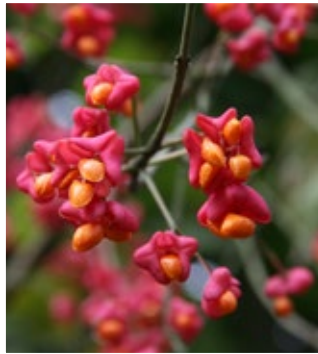
Euonymus Europaeus 1+1 (Spindle) - 5%