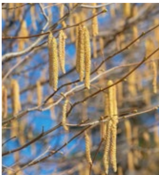
Corylus Avellana 1+1 (Hazel) - 5%