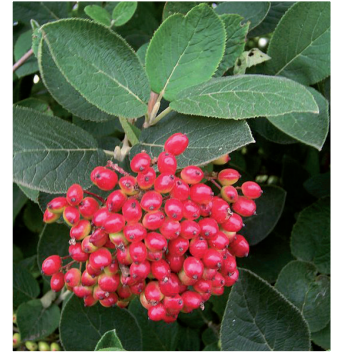
Viburnum Lantana 1+1 (Wayfaring tree) - 5%