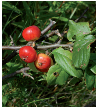
Malus Sylvestris 1+1 (Crab apple) - 5%

Some species may be changed according to availability and to suit particular soil conditions, but the percentages should remain the same.