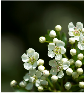
Crataegus Monogyna 1+1 (Hawthorn) - 60%