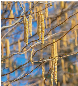
Corylus Avellana 1+1 (Hazel) - 5%