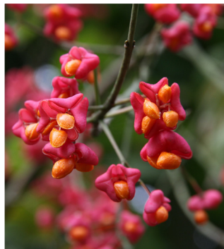
Euonymus Europaeus 1+1 (Spindle) - 5%