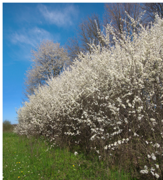
Prunus Spinosa 1+1 (Blackthorn) - 10%