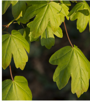
Acer Campestris 1+1 (Field Maple) - 5%