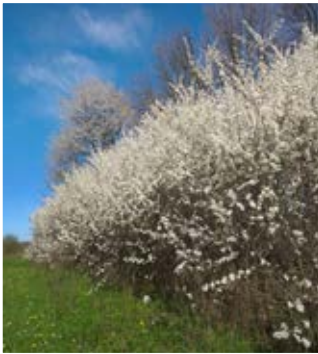
Prunus Spinosa 1+1 (Blackthorn) - 10%