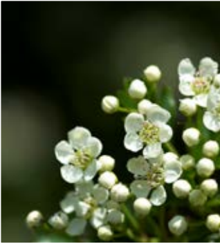
Crataegus Monogyna 1+1 (Hawthorn) - 60%