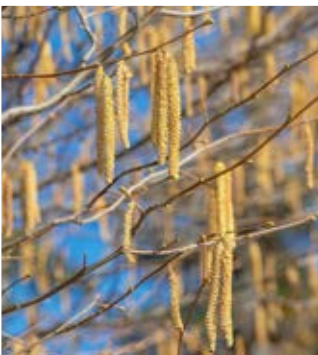
Corylus Avellana 1+0 (Hazel) - 5%