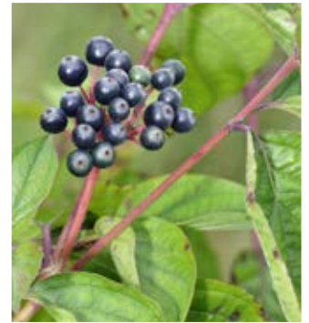
Cornus Sanguinea 1+1 (Dogwood) - 5%